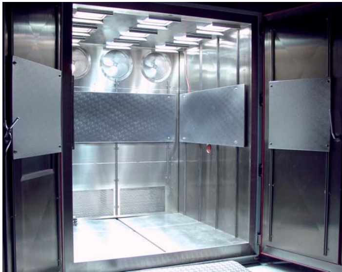
Climatic chamber with 9 SOL 2000 units

Special metal halide bulbs produce the light spectrum. Metal halides hermetically sealed inside the bulb are vaporised by an electric arc and generate a spectrum, which is close to that of natural sunlight. SOL units do not produce ozone .