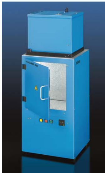
Sun simulation chamber UVACUBE 400

Alternative filters are available which can vary the spectrum to suit users needs.