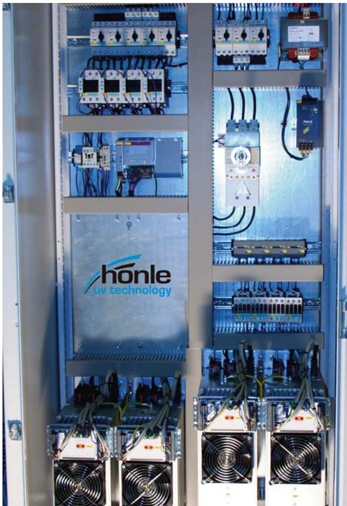
Sun simulation switch cabinet

The high efficiency and long lifetime of the Hönle metal halide bulbs makes solar simulation with SOL units economically attractive. They can be integrated into climate test cabinets and chambers as well. Thus, multi-parametric tests can be done. The units can be fixed outside the climate chamber and radiate through high-grade filter glass into the testing room. High quality filter glass protects the SOL units from humidity and temperatures from inside the chamber, and avoids undesirable interaction between the bulbs and external contaminants. By simply adding another glass filter, outdoor irradiation can be changed to indoor irradiation (or vice versa).