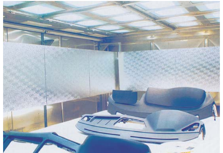
Climatic chamber with 24 SOL 1200

Beside conventional ballasts you can also use electronic power supplies (EPS) made by Hönle. These EPS supply the lamp with a rectangular current that improves the performance of the luminous flux. Thus, the power output increases by approx. 10%.